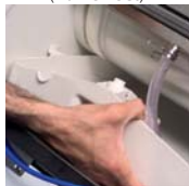
Easy to remove water sump