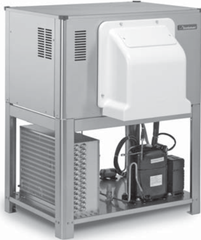
ABS Ice Chute Cover: sold separately.