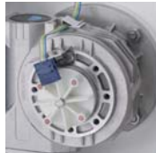
Gear box protection (hall effect)